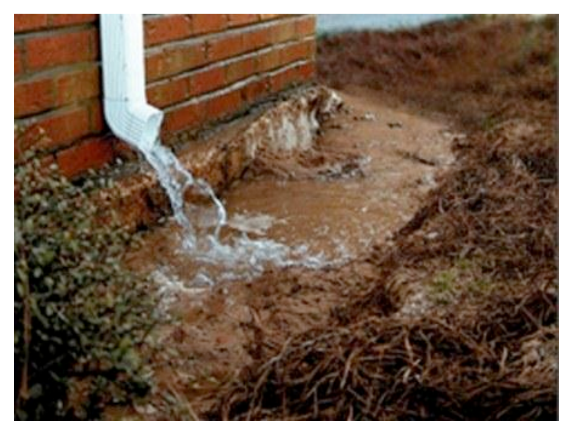
- how NOT to have your downspouts ending!

When window wells are needed - have them properly installed including adequate drainage at the base.