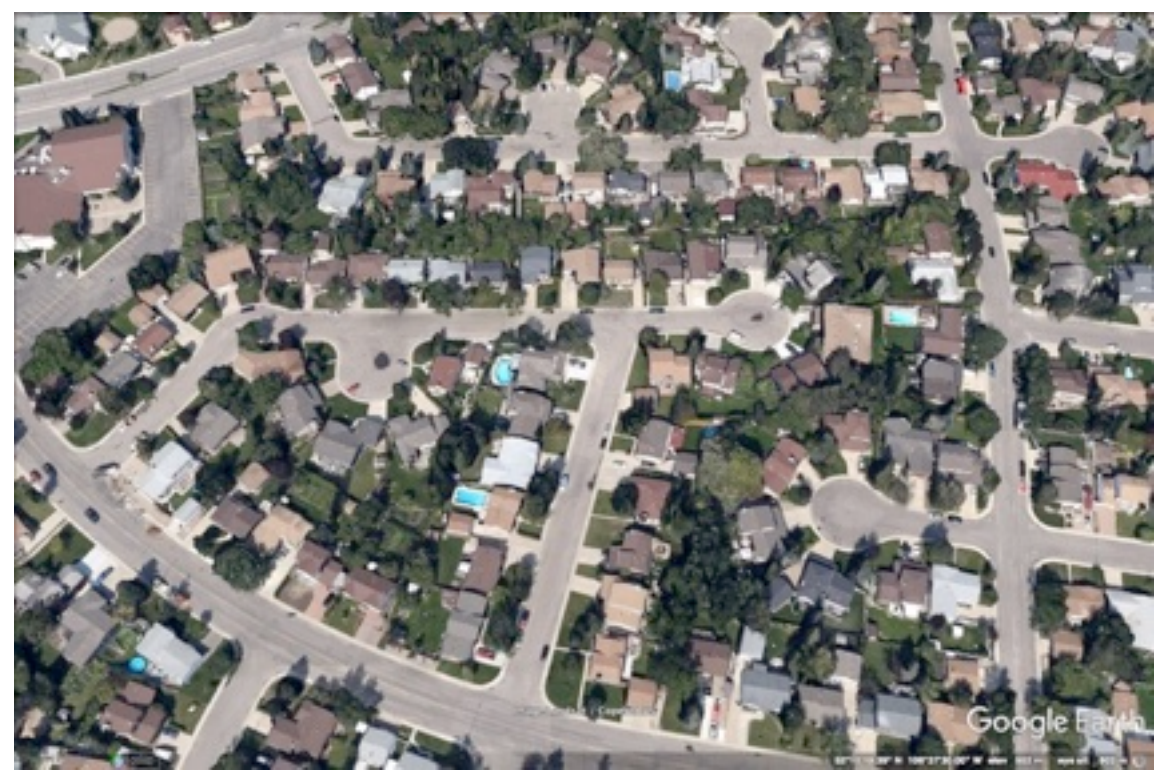
- a lot of surface in our neighbourhoods is covered by roofs!

A comment made by my Son years ago still resonates with me you have this huge square footage of your roof collecting rain & snow runoff - then it travels down your spouts & ends up in your yard. Luke totally agrees with that observation - you want to direct H20 far away from your foundation - a minimum of at least 3' away from your house (preferably 6' or more) Ensuring all your eaves & downspouts are in good repair & are cleaned regularly goes without saying.