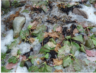
- perennial Bergenia stays green even in Winter. Come Spring, it's one of the first to perk up & produce flowers - amazing that!

( Spring --- Soon, very soon Saskatoon !)