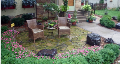
• even a charming bistro table & chairs create a welcoming look

Another idea you might entertain is to develop the centre with a miniature rock garden & place seating to take advantage of different views. Consider too, how it might look year 'round when viewed from your living or dining room window. Possibilities really are endless!