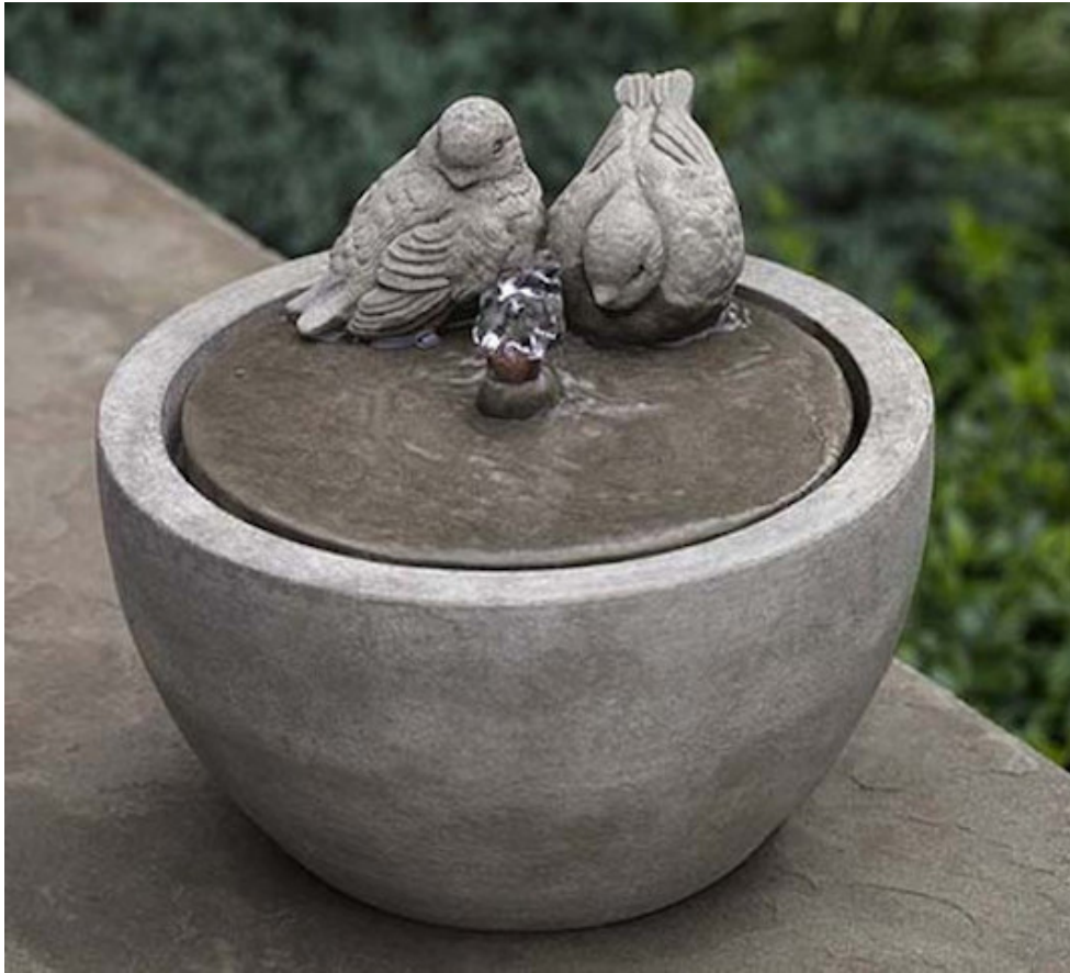
- quaint table top recirculating fountain

We looked at the simple Tub Garden last month so now let's take a peek at a few samplings of what is available to add to our little Edens.