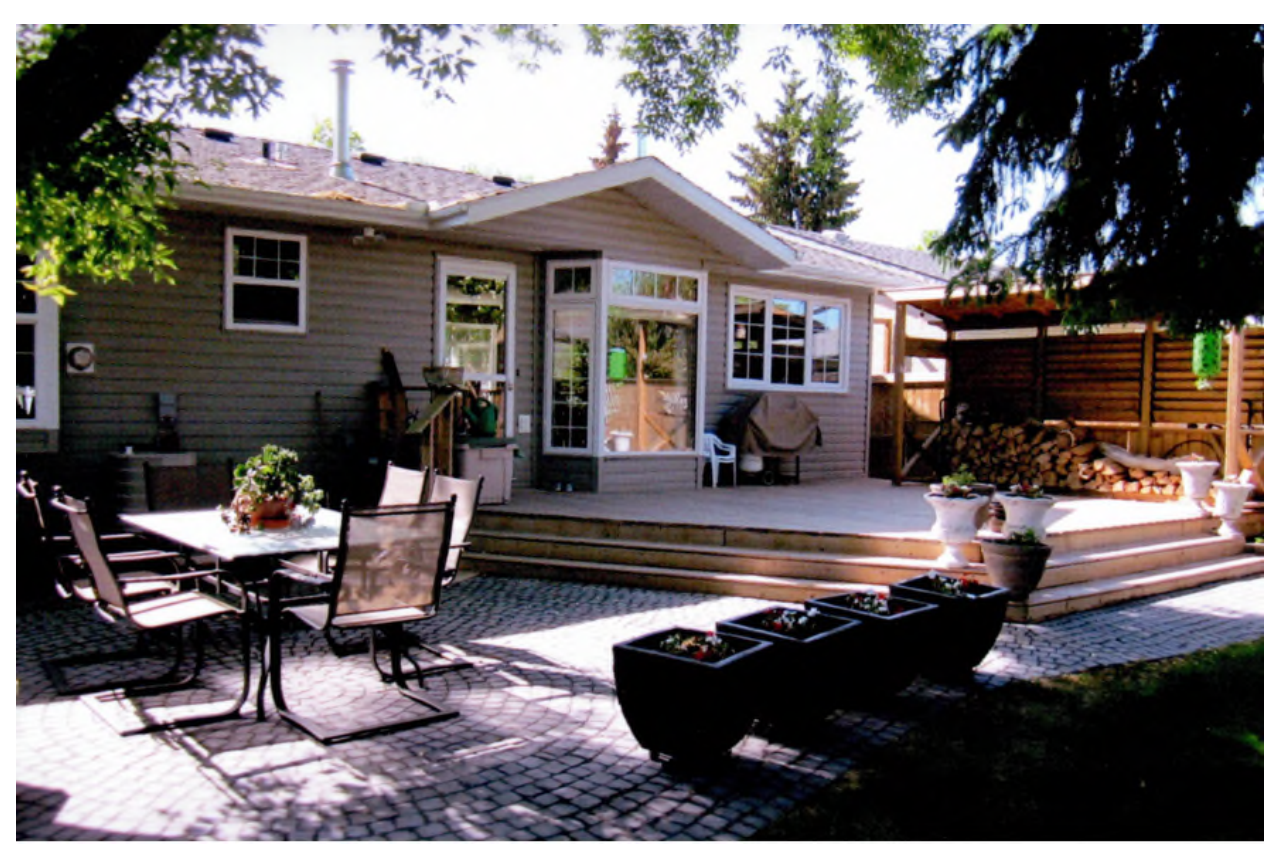
- a yard planned by a Class participant.