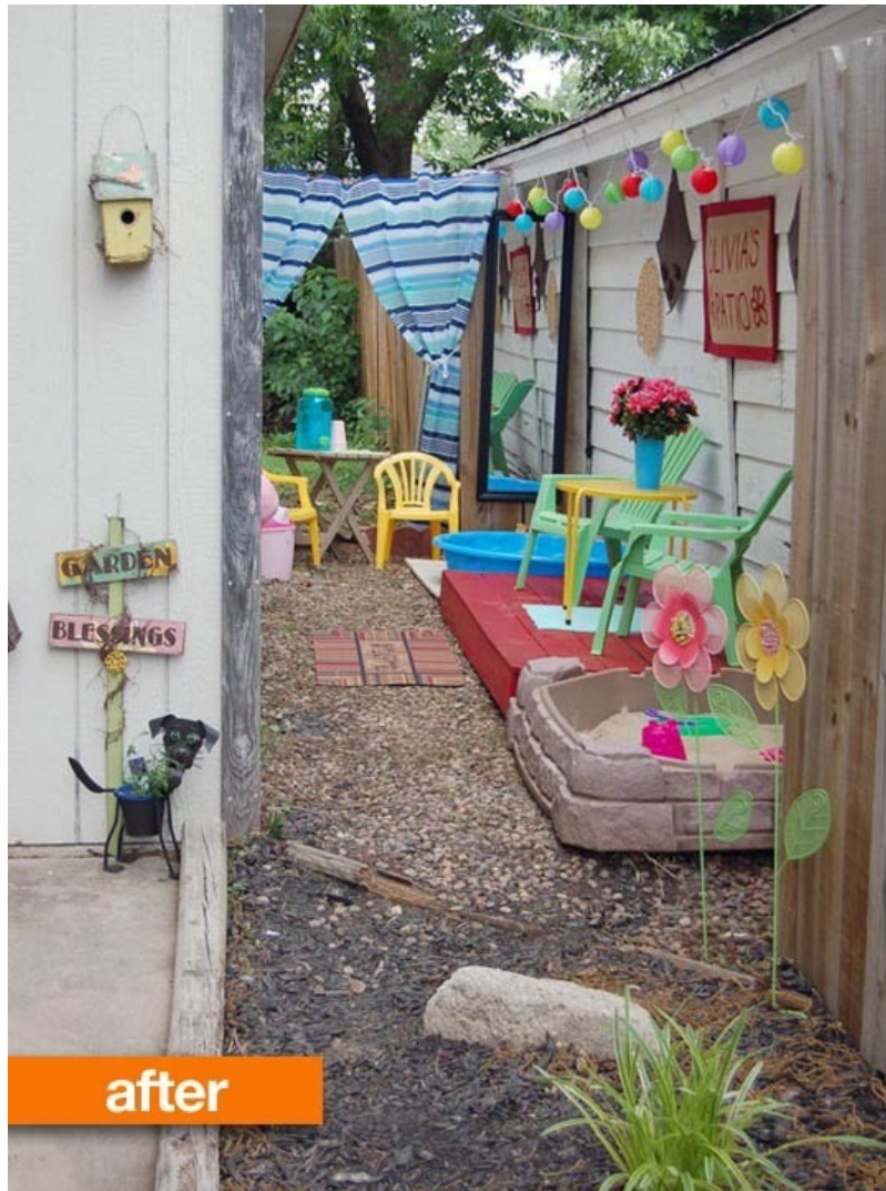
- a 'sweet spot' for kids to play

Possibly consider developing your garden near an entry to the house or to the yard.