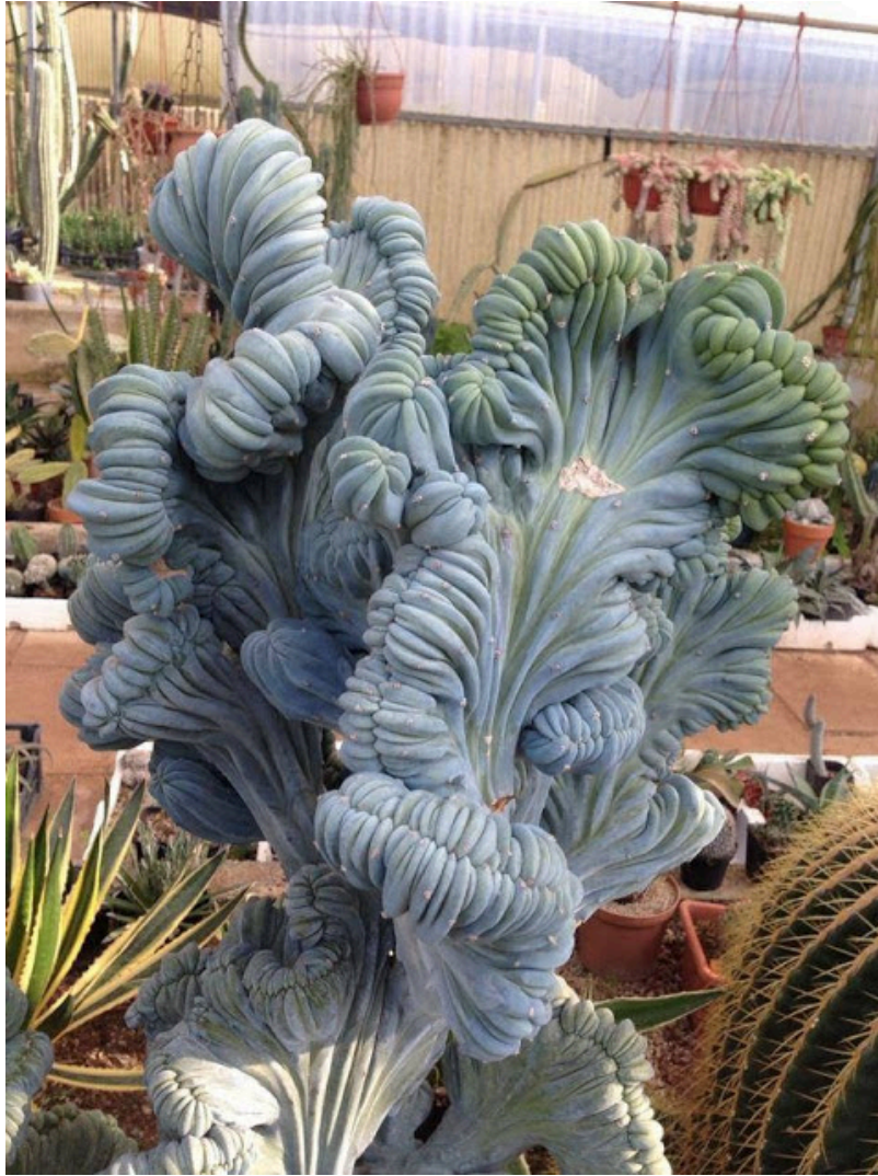
- a variety of Cactus - Trichocereus pachanoi (San Pedro) cristata

Once again Mother Nature trumps Man in the Design Department - how DOES a plant know how to grow like that?