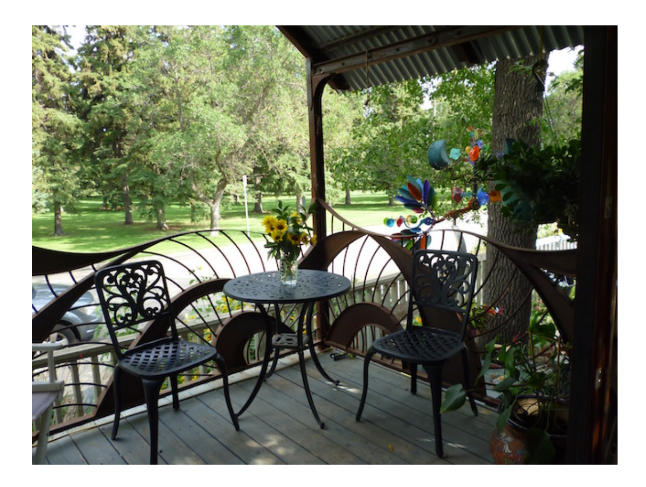
- just LOOK at the view! This homeowner has obviously identified the incredible park scene as something to take advantage of.... even with the deck railing being an "objet d'art" in itself.