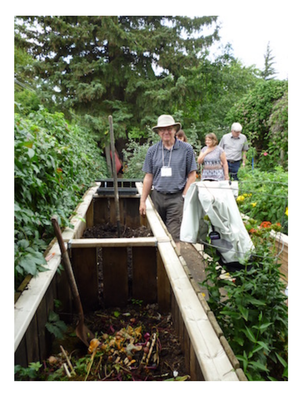
- a rightfully proud homeowner shows off his 3-bin recycling system (one bin is freshly added vegetative matter, the second is in the process of composting while the third is ready for use!)