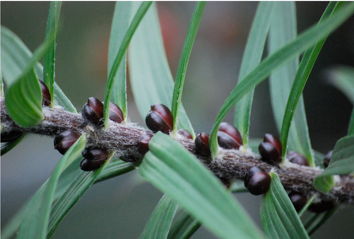
- Lily bulbils

True Lilies are the Genus ' Lilium ' They grow from bulbs & can reproduce from the base bulb or from 'bulbils' originating on the stems, depending on the variety.