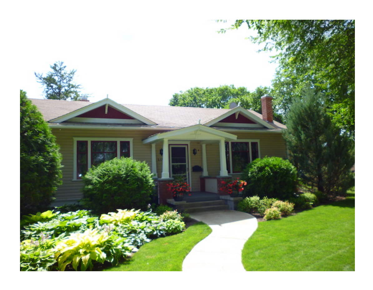
- stunning local front yard featured on a NEST Garden Tour

I recommend a minimum width of at least 3'- 4' with 5' being the best option. It allows two people to stroll along without feeling crowded & creates an open, welcoming experience.